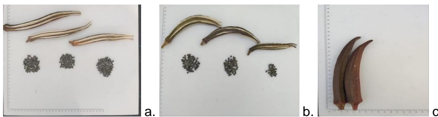
Figure 1. Okra pods and seeds, variety Smaranda (a), variety Acme (b) okra capsules

The number and mass of capsules obtained per plant, the number and mass of seeds were determined by biometric measurements and weighing (Fig. 1).