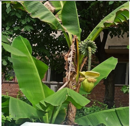
Musa x paradisiaca - original