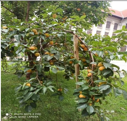
Diospyros kaki - original