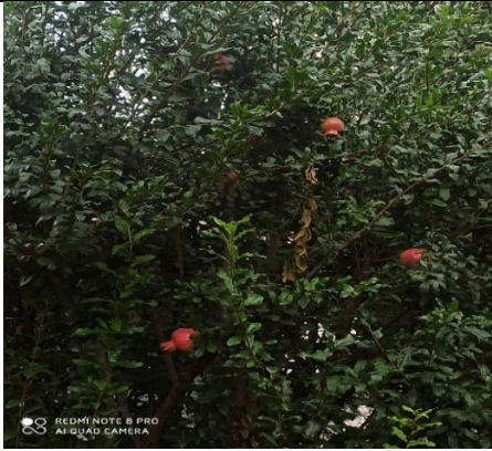
Punica granatum - original