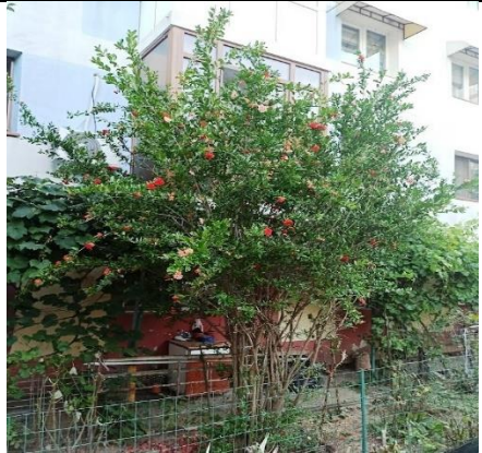
Punica granatum - original